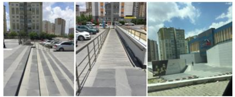
Figure 12. Kaysermall Shopping Centre Entrance (Saffet Arıkan Bedük Street Direction) [28]

the Municipality in the area used for transportation from the pedestrian and open car park. All entrances in Kayseri Park and Forum Kayseri are without stairs. The entrance in the Saffet Arıkan Bedük Street direction in Kaysermall has stairs and a ramp (Figure 12). There is no tactile surface application in this area. It is seen that the three shopping centres comply with the universal design principles in terms of transportation. In order for the shopping centres to serve all user groups, it is recommended to apply a tactile surface in the area outside the building, and to ensure that public transportation and service vehicles are suitable for all users. When the examined shopping malls are evaluated as entrance and orientation, it is seen that Forum Kayseri meets all the universal design criteria thanks to its audible surface, audio description on the digital screen and Braille alphabet applications. It can be said that Kayseri Park and Kaysermall do not meet the criteria of equal use, perceptible information, and fault tolerance due to the use of slippery ground at the entrance tactile surface and lack of sufficient information. Also, notice boards at the entrance in the Saffet Saffet Arıkan Bedük Street direction in Kayserrmall and the direction appear to have negative aspects due to uneven ground (Figure 12).