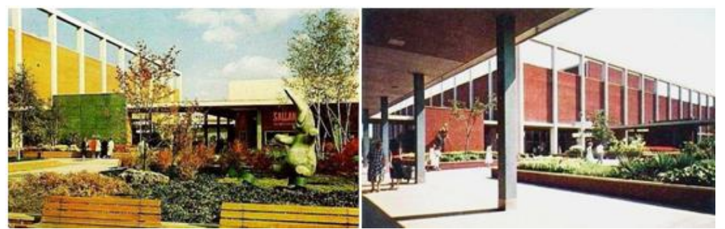
Figure 1. Northland Shopping Centre, North-western, USA, 1952 [11]

Gostiny Dvor, which is considered as the first modern shopping structures in Russia, was planned and built as a shopping centre in 1785, and later shopping centres were built in different countries. The first shopping centre, which was produced with the concept of mall instead of traditional commercial spaces in the city centre and forms the basis of modern shopping centres in today's sense, was designed and implemented by architect Victor Gruen. The desire of the users to enjoy shopping in places that offer quality and product variety, as if they were living and wandering in the city centre, without being affected by climatic conditions came to life in the first half-open Northland Shopping Centre consisting of masses and open spaces [8] (Figure 1). In the process, many buildings such as offices, residences, and hospitals were built around the shopping centre in support of Gruen's design thinking, and the shopping centre turned into a structure that created attraction for users. The fact that the access to the upper floor is provided by an escalator in the design of Northland Shopping Centre also shows that the upper floor s of the shopping malls can be used functionally as well as providing a comfortable and third-dimensional space richness in the shopping action of the users, and that the exterior should be given as much attention as the interior design. In the process, many shopping Gruen's design principles have been designed [2, 11].