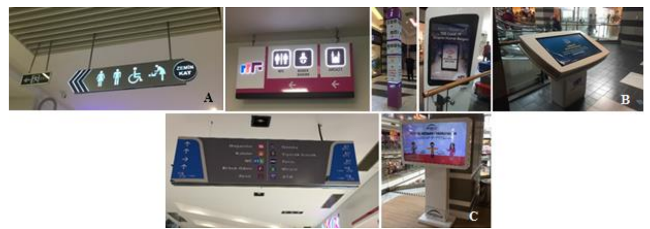
Figure 7. Information and Direction Signs A.Kayseri Park, B.Forum Kayseri, C Kaysermall [28]

Information and Direction Signs: Horizontal-vertical circulation, emergency escape points, and common areas are shown with the direction sign expressed with international visual signs and symbols in Kayseri Park. It is designed in accordance with perceptible information and provides comfortable use (Figure 7A). In Forum Kayseri, horizontal-vertical circulation, emergency escape points, communal areas and spaces are shown with direction signs expressed with international visual signs and symbols, digital touch screens. It is designed in accordance with perceptible information and provides comfortable use (Figure 7B). Kaysermall has similar features with the other two shopping centre. Information is also provided on the digital screen in Kaysermall (Figure 7C).