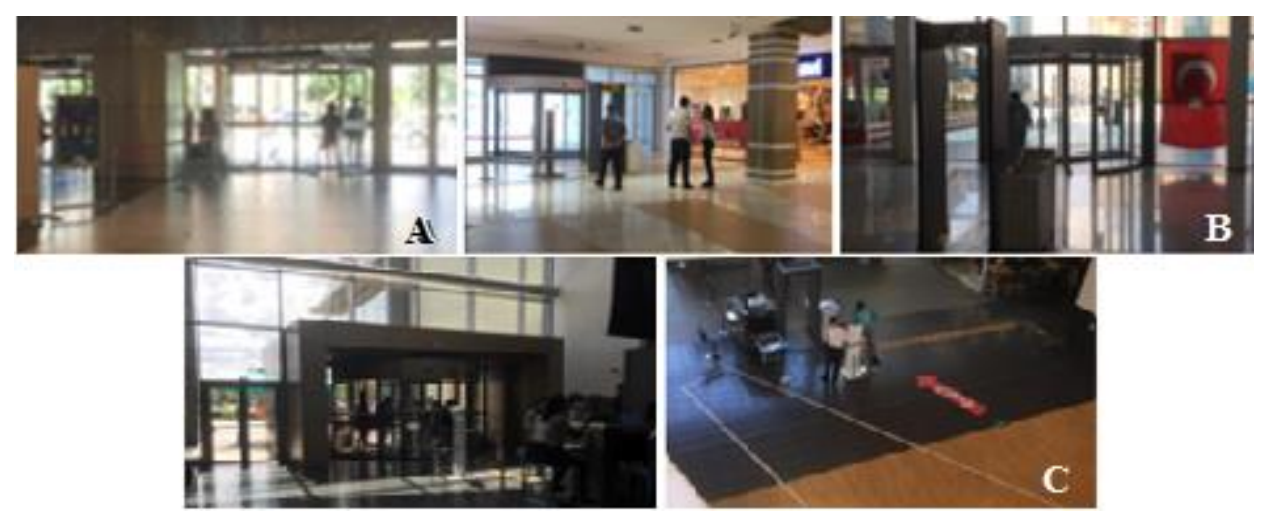
Figure 5. Entrance and Direction A.Kayseri Park, B.Forum Kayseri, C.Kaysermall Shopping Centres [28]

Entrance and Direction: Kayseri Park has two entrances and there are no embossed or palpable surfaces at the entrance. This situation creates a problem for visually impaired individuals and therefore does not provide equal use (Figure 5A). Forum Kayseri has embossed and palpable surfaces at all four entrances. The presence of an embossed and tactile surface ensures appropriate use for visually impaired and demonstrates its compliance with the principle of equal use (Figure 5B). There are no embossed and tactile surfaces at the entrances of Kaysermall. This situation creates a problem for visually impaired individuals and therefore does not provide equal use (Figure 5C). Table 8