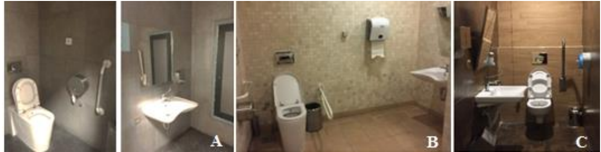
Figure 10. Disabled Toilets A.Kayseri Park, B.Forum Kayseri, C Kaysermall [28]

In all three shopping centers, disabled toilets are designed as separate units. It is in the same corridor as the toilets and is designed according to TS 9111 standards [29]. The necessary width and comfortable transportation are provided for wheelchair users. Kaysermall has slightly narrower area compared to the other two shopping centers. There is visual and written information on the handicapped toilet door. It follows the principles of simple and intuitive use with perceptible information. In all three shopping centers, as specified in TS 9111 standards, there is a door opening to outside, a push door that provides low physical strength, an accessible and slotted washbasin at an appropriate height, toilet bowls and equipment, while maintaining the user's body position. Inclined mirror and motion sensitive ship-owners were not used in Kayseri Park, but they were used in Forum Kayseri and Kaysermall (Figure 10).