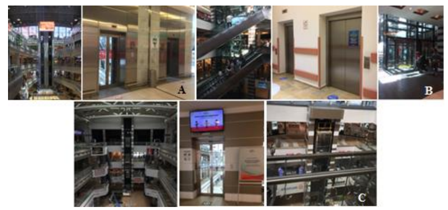
Figure 8. Circulation Elements A.Kayseri Park, B.Forum Kayseri, C Kaysermall [28]

atrium. Thanks to this, it is perceptible and accessible (Figure 8A). In Forum Kayseri, there are elevators located in the main corridor and the service corridor (Figure 8B). All elevators are readable and accessible with information and direction signs. In Kaysermall, elevators are located at both ends of the atrium and are perceptible, readable and accessible (Figure 8C). Escalators providing vertical circulation in all three shopping centres are accessible, simple and understandable areas. At the same time, it does not create confusion as the landing and exit stairs are built together. They are non-slip, greppable and suitable for the right/left hand use. Escalators are generally located in gallery spaces where natural light can be used. At the same time, there are warnings, information signs or diagrams at the starting point of the stairs.