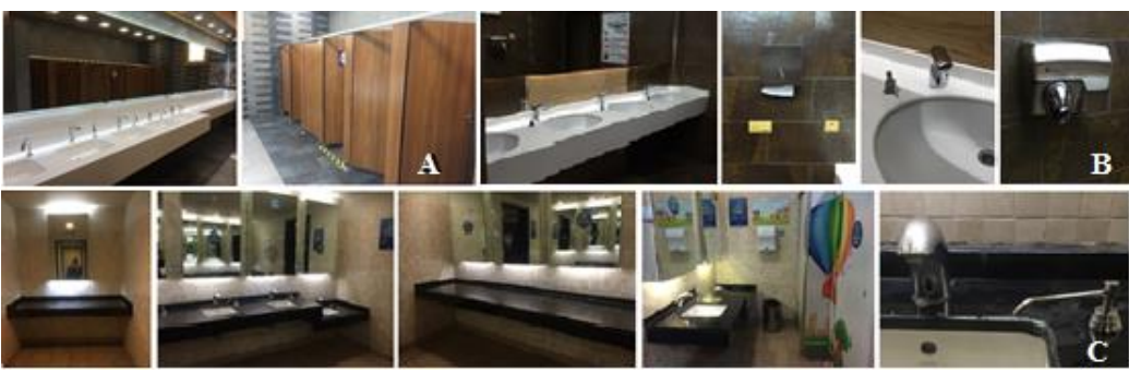
Figure 9. Circulation Elements A.Kayseri Park, B.Forum Kayseri, C Kaysermall [28]

In all three shopping centers, disabled toilets are designed as separate units. It is in the same corridor as the toilets and is designed according to TS 9111 standards [29]. The necessary width and comfortable transportation are provided for wheelchair users. Kaysermall has slightly narrower area compared to the other two shopping centers. There is visual and written information on the handicapped toilet door. It follows the principles of simple and intuitive use with perceptible information. In all three shopping centers, as specified in TS 9111 standards, there is a door opening to outside, a push door that provides low physical strength, an accessible and slotted washbasin at an appropriate height, toilet bowls and equipment, while maintaining the user's body position. Inclined mirror and motion sensitive ship-owners were not used in Kayseri Park, but they were used in Forum Kayseri and Kaysermall (Figure 10).