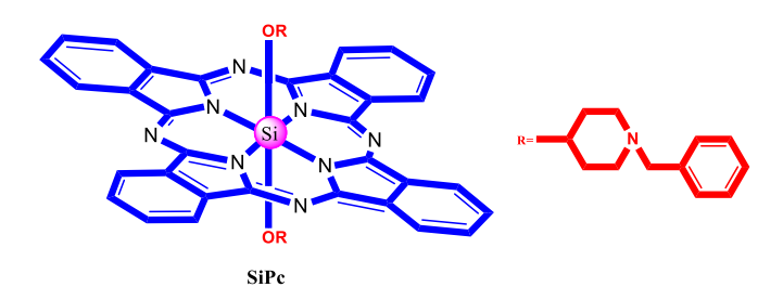
Figure 1. Axially 1-benzyl-4-oxy substituted silicon phthalocyanine

In our previous work, we investigated electrochemical, photocatalytic and aggregation behaviour of 1-benzyl-4oxy substituted silicon highly soluble in most of the organic solvents and are investigated aggregation